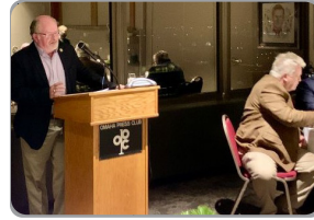
SEE PAGE 2