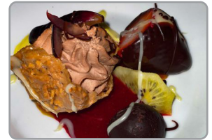
SEE PAGE 3