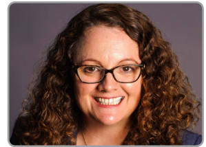
SEE PAGE 2