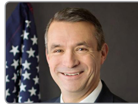
SEE PAGE 2

VOLUME 88 • NUMBER 41 SEPTEMBER 2020 WWW.OMAHAPRESSCLUB.COM