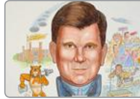
SEE PAGE 2