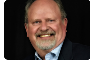
SEE PAGE 3